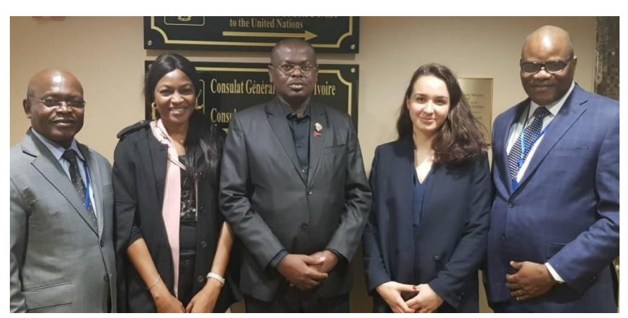
Hon Kra Eugène Kouassi (Côte d'Ivoire), Hon Aminata Gueye (Senegal) and Sophie Millot (GHA) with representatives of the Permanent mission of Côte d'Ivoire.

government on the HLM, and letters to Heads of Government and public officials requesting the highest level of political representation during the event.