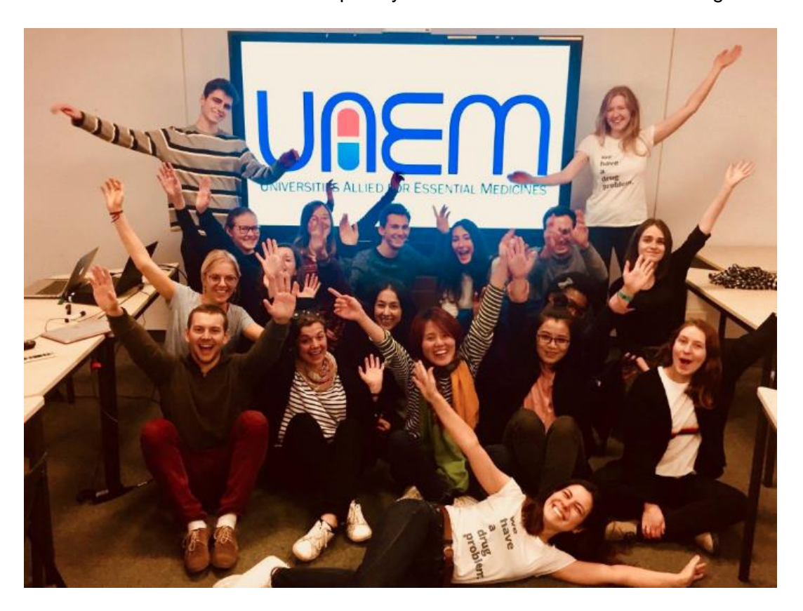
UAEM students at the workshop on R&D and access to medicines in Paris

At the end of the workshop, GHA and UAEM co-drafted a position paper on access to medicines, that included the main asks developed by students at the end of their training.