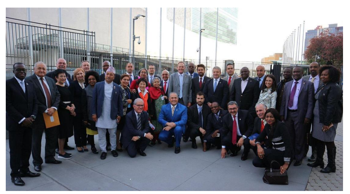
Parliamentary Consultation in NYC, USA - About 40 Members of Parliament from the GTBC at the United Nations to advocate for TB before UN permanent missions

Firstly, to secure an ambitious outcome document, GHA supported the organization of a Parliamentary Consultation in New York prior to the UN HLM by the Global TB Caucus. GHA particularly supported and coordinated the francophone group during the event. Out of 40 Members of Parliament, four francophone parliamentarians attended the event, from Côte d'Ivoire, Senegal and France. Our group then met with representatives of francophone Permanent missions to present our recommendations and advocate for an ambitious Political Declaration on TB. Coming back from the event, GHA continued to engage francophone missions in Geneva and New York on the UN HLM on TB, sending out key inputs and feedback on the text during the negotiations in June.